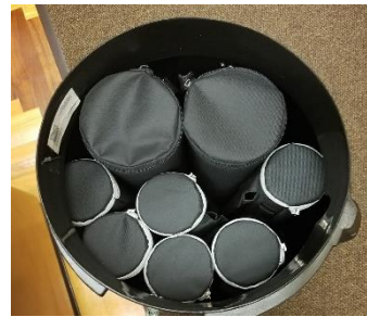
Each container holds 6 banners and 6 hardware sets.

In addition, a shipping container holds: